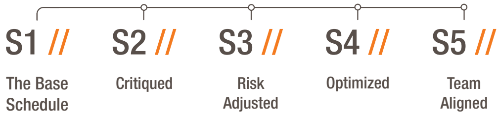
Figure 1 - Five Stages of Schedule Maturity

accomplished thus overcoming one of the biggest project management challenges today: poor and unrealistic planning.